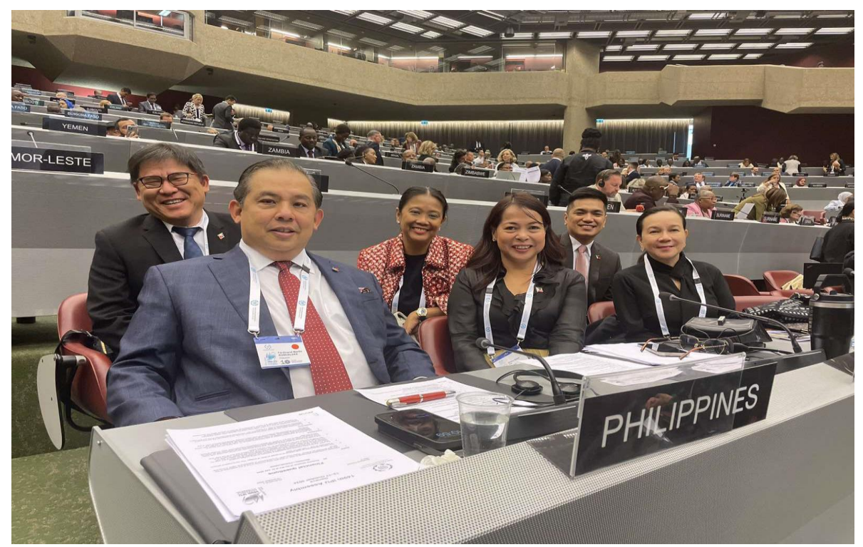
The Philippine Congressional delegation during the opening session of the 149th IPU Assembly

At the General Debate focusing on "Harnessing science, technology and innovation for a more peaceful and sustainable future", Speaker Romualdez highlighted the progress done by the Philippines in the areas of science, technology, and innovation, particularly through the creation of the National Innovation Council, to ensure that innovation is embedded as a key priority in the country's pathway to socio-economic development.