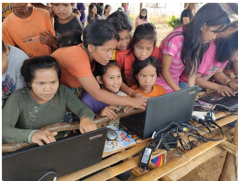
DICT’s winning entry in the WSIS Photo Contest “Indigenous Children’s Eagerness to Digital Literacy”, Bansud, Oriental Mindoro

PH also emerged as one of the winners of the WSIS Photo Contest, with DICT’s entry entitled “ Indigenous Children’s Eagerness to Digital Literacy ”. Winning Member States are recognized during the awarding ceremony, highlighting their contributions to leveraging ICTs for societal challenges, and emphasizing excellence and innovation in utilizing ICTs for sustainable development.